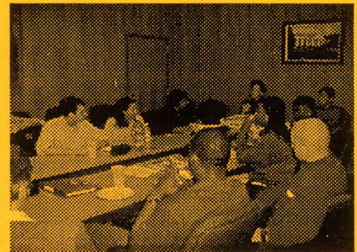
The focus group meets in the Dean's Conference Room with pizza to discuss various issues

Other comments: students wanted more feedback in general from professors ... the grade expectation curve was discussed ... and students discussed the need for better dissemination of information (about registration, for example).