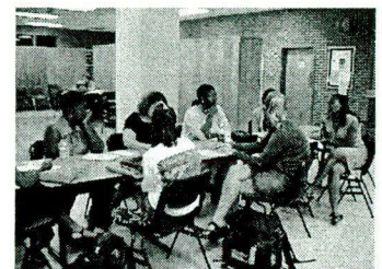
Members discuss plans for the upcoming Wellness Program.

Caucus plans to have a Wellness Program On Sat., Nov. 16. The agenda includes a financial planner, a session on professional etiquette, and tips from a golf pro.