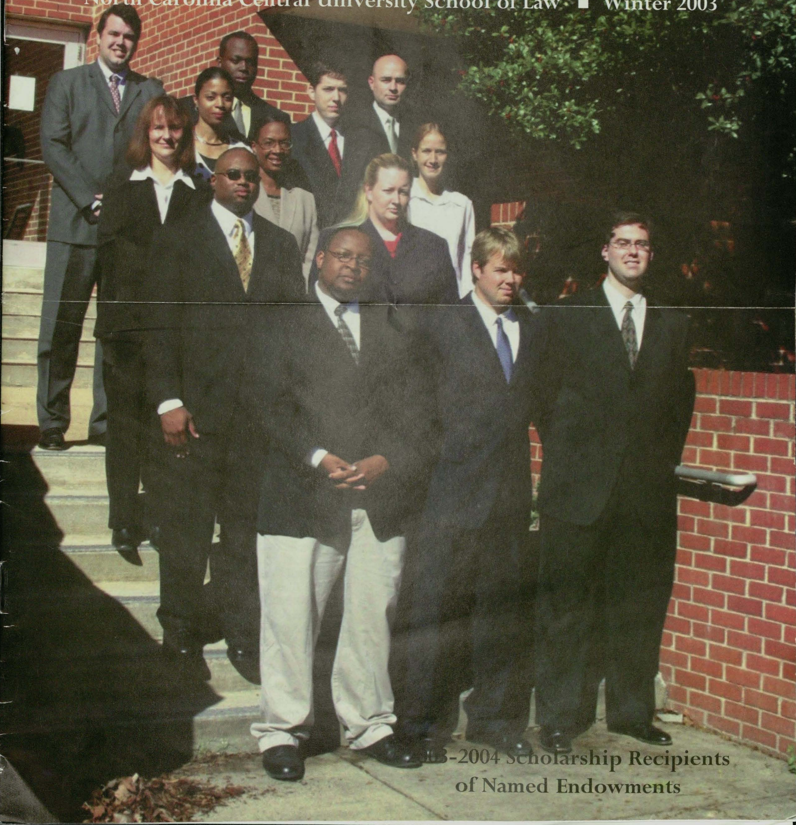
2003-2004 Scholarship Recipients of Named Endowments

North Carolina Central University School of Law ■ Winter 2003