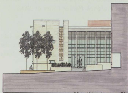
O'Brien/Atkins Associates, PA

Celebrating Advancing Diversity Justice North Carolina Central Law