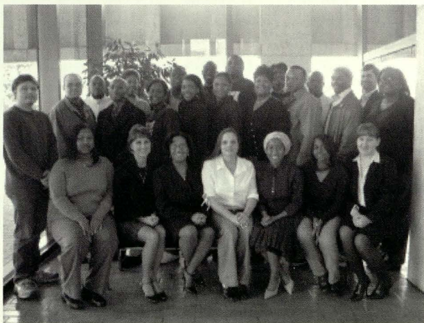
“Former PBAPers” currently at the Law School

2005 marks the 20th anniversary of the Performance-Based Admissions Program (PBAP). The pilot program for the first PBAP class took place in the summer of 1985, funded by a grant from the Law School Admission Service (LSAS).